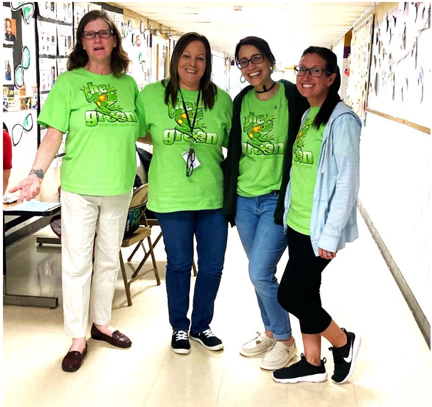
Vintage Earth Day Tee Shirts